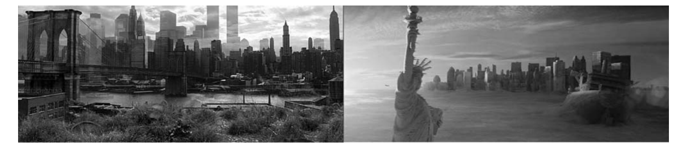
Fig. 6. Gangs of New York (2002) In Gangs of New York the 1863 skyline fades into a pre 2001 version that includes the World Trade Towers along with other iconic elements of the 20<sup>th</sup> century; The Day After Tomorrow (2004) The CGI view of the frozen New York skyline, featuring the Statue of Liberty.

Directors whose genre focuses on catastrophe, had to find a way to continue to create films. Roland Emmerich continued to make disaster films of New York, wrecking, at least compared to Godzilla and Independence Day, restrained havoc on New York's remaining iconic architecture. The Day After Tomorrow (2004) centers around the destruction of the majority of the inhabitants as well as nature related damage to the buildings in the city due to the effects of a rapid and catastrophic ice age that has been caused by Global Warming, rather than terrorists or aliens. In contrast to Independence Day and Godzilla, the Empire State Building, Chrysler Building and Stature of