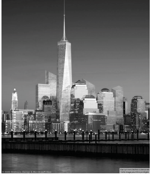
Fig. 11: The New York Skyline with the Freedom Tower. Most current promotional images are set in a vertical format and exclude the portion of the skyline that contains the Empire State Building.

It will remain to be seen whether the construction and completion of the Freedom Tower will be forcefully embraced by the film industry as its construction proceeds over the next several years. It will indeed alter the New York skyline and provide a new era for urban settings and architectural relationships.