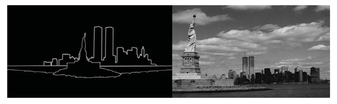
Fig. 3. Escape from New York (1981): The manipulated identity skyline of New York City – ingredients: Statue of Liberty, World Trade Towers and a diminished Empire State Building in the distance vs. the actual skyline.

in the "establishing shot" and guaranteed a gritty level of realism in the representation of the urban spaces and architectural icons in the film, as well as the relationship between the buildings and the action in the film. Location shooting was far less expensive, more realistic and more flexible than the construction of vast model based or full size sets that existed on the New York modeled back lots in California.