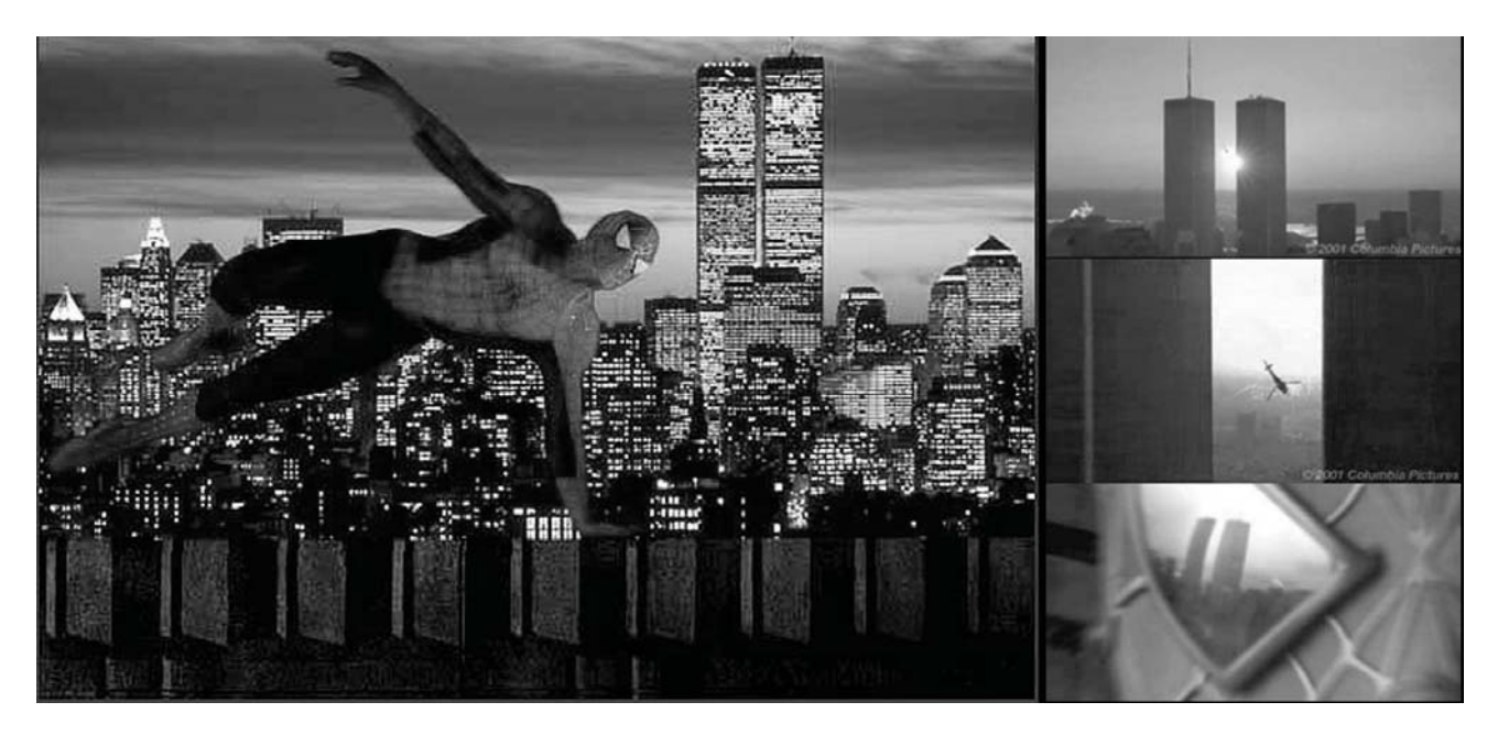
Fig. 9. Original promotional images of Spiderman, pre 9/11 that were pulled after the events.

Films that were largely CGI based could take a more inventive approach to the reintroduction of modern, post 9/11 New York to the film version of New York. These films were not dependent on location filming. They could be selective about the amount of "architecture" used in the film sets and be quite manipulative about how this architecture