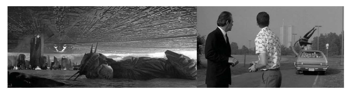
Fig. 5. Independence Day (1996) The Statue of Liberty and the World Trade Towers as illustrated in the destruction of New York by aliens in Independence Day; Men In Black (1997) The World Trade Towers form an establishing backdrop behind a comedic scene in Men In Black

to voluntarily come from within the film industry, not from external sources.