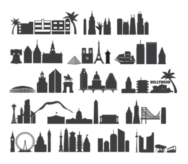
Fig. 1. Silhouettes of well known City Icons. 1

TERRI MEYER BOAKE University of Waterloo