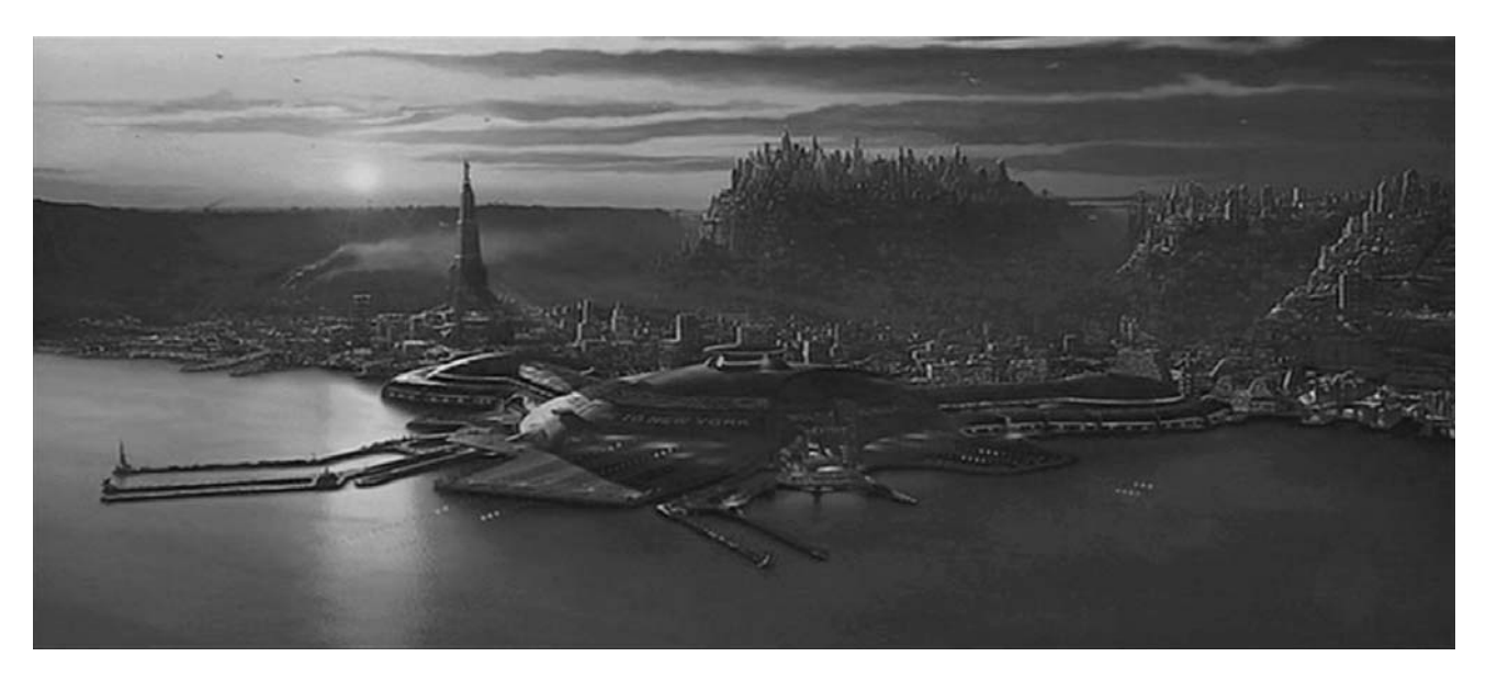
Fig. 4. The Fifth Element (1997) Jean-Claude Mézières' New York skyline for The Fifth Element.

derstanding of the film in its representation of the future of New York, rather than an anonymous unnamed place.