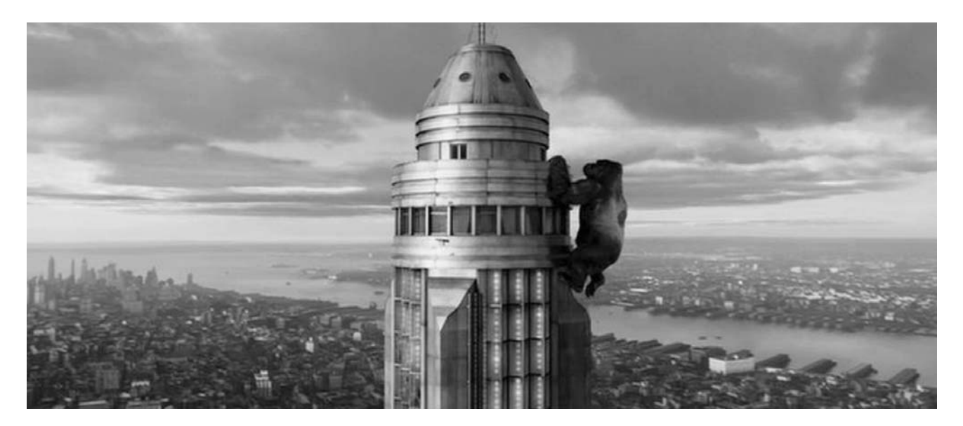
Fig. 8. King Kong (2005) King Kong climbs to the top of the Empire State Building, making physical use of the detail provided by the architectural style of the period.

"To help build New York City environments ... a one week digital photo safari, gathering static photographic textures of period urban architecture. WOT then referenced the textures to develop a 3D model representing a four-block area of the