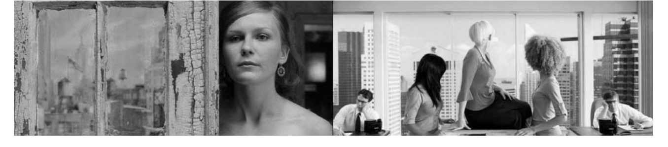
Fig. 10. Spiderman 2 (2004) The Empire State Building is vaguely recognizable in the reflection as M.J. looks out of Peter Parker's balcony window; Spiderman 3 (2007) Citicorp and the ATT Building in the skyline.

In Spiderman 3 Raimi has increased his repertoire of CG buildings, using the ones from Spiderman in the distance, Spiderman 2 at mid ground and with improved technology, the newest additions in the foreground of Spiderman 3.<sup>17</sup> Spiderman 3 also used more actual footage of the city in both the distant establishing shots as well as the action sequences. This was done using a Spydercam<sup>18</sup> which captured the motion shots while a camera was run along wires that were suspended from tall building to tall building, over the city streets of midtown New York. These live action sequences were blended with large scale physical models of